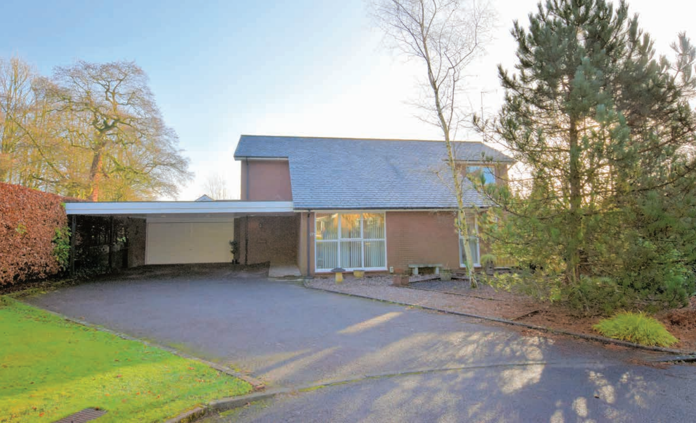
The Copse Turton, Bolton BL7