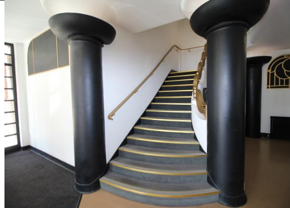
Art Deco Stairwell