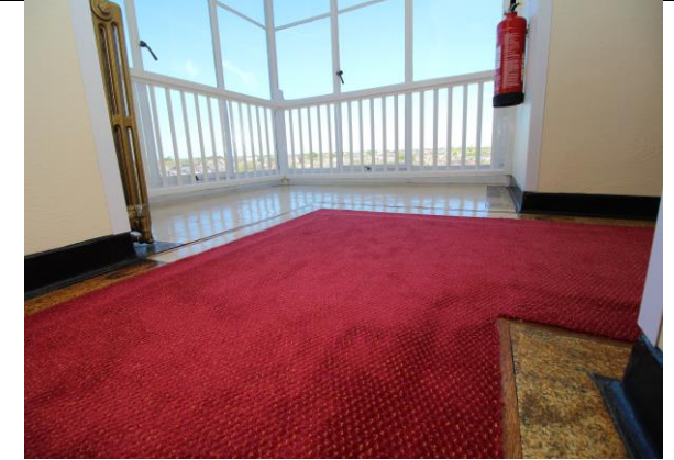
7 th Floor Viewing Platforms