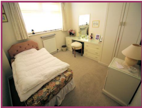
GROUND FLOOR BED 3