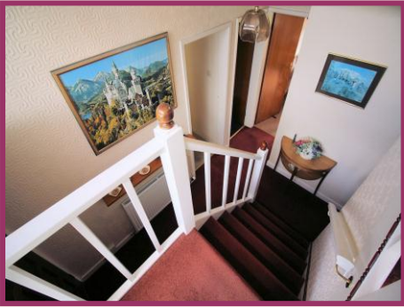
HALL & STAIRS

Please note: all viewings are by appointment only through our BURY Office