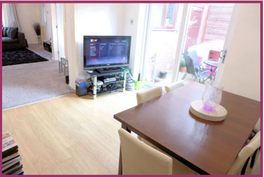
DINING - LOUNGE