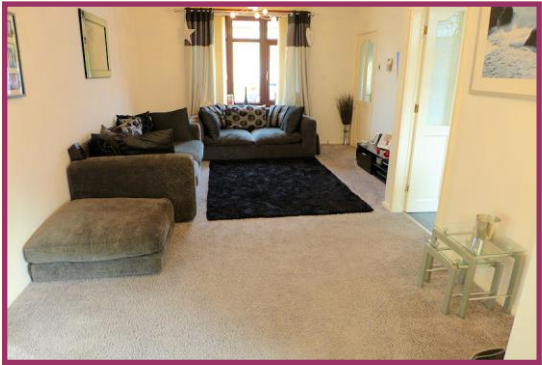
LOUNGE - DINING