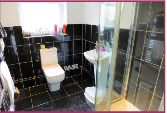
GROUND FLOOR SHOWER ROOM