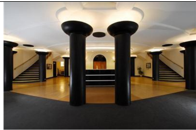
24 hour concierge desk