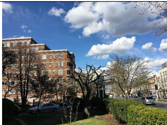
Du Cane Court